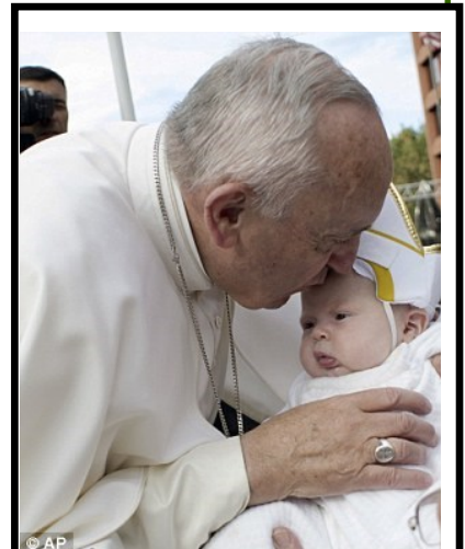
Pope Francis kisses a baby girl , who came to the Papal parade in Philadelphia dressed like the Pontiff. Maybe a future female Pope!?!