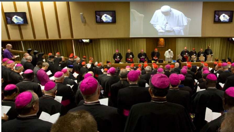
Pope Francis at the first day of the Synod